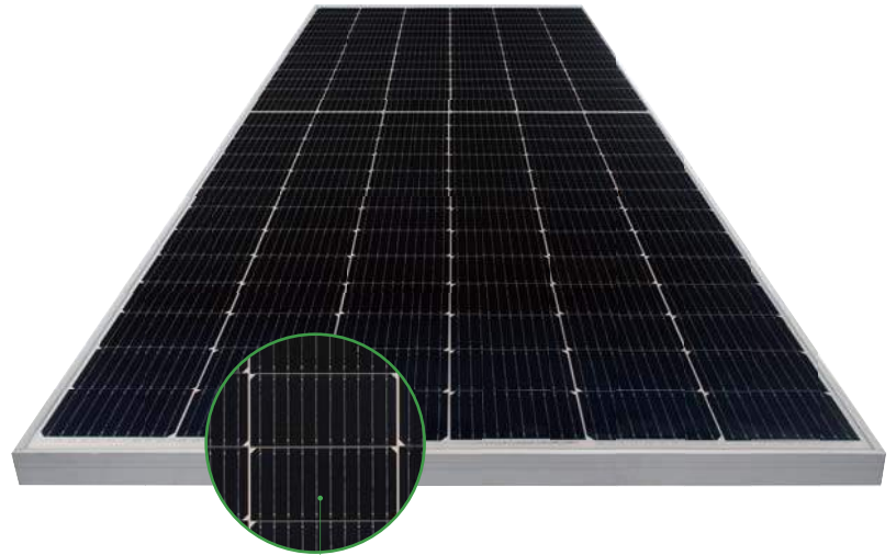
MBB HC Technology

Occupational health and safety management systems